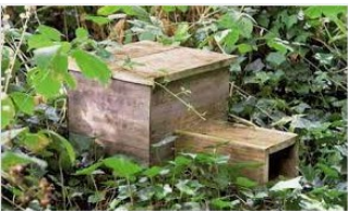
Build a Hedgehog House hedgehog-rescue.org.uk

Also check nest boxes and bug hotels to make sure they're clean and sturdy ready for their winter & spring inhabitants. You can also use autumn clippings to create a ground heap for use by insects that hibernate at ground level, or for local hedgehogs to use to create a nest; they tend to create a small burrow which is then covered with garden material such as leaves and twigs to make a cosy nest.